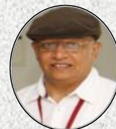
Sunil Arora India